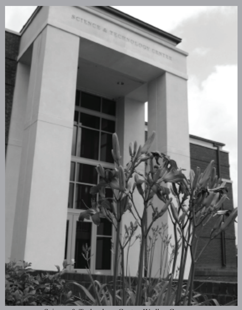
Science & Technology Center, Wadley Campus