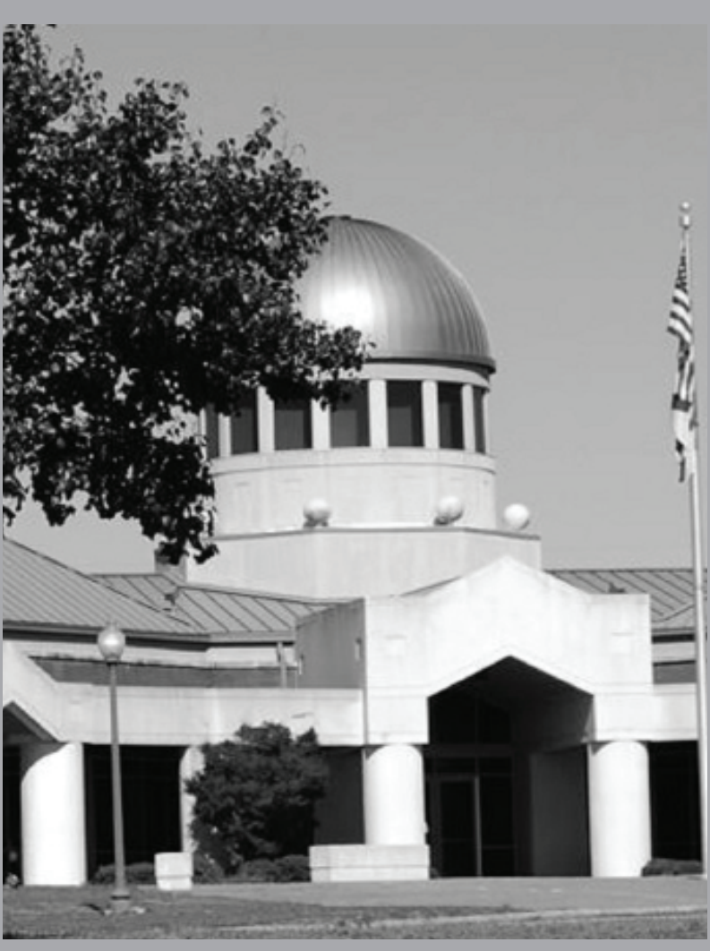
Administration Building, Opelika Campus