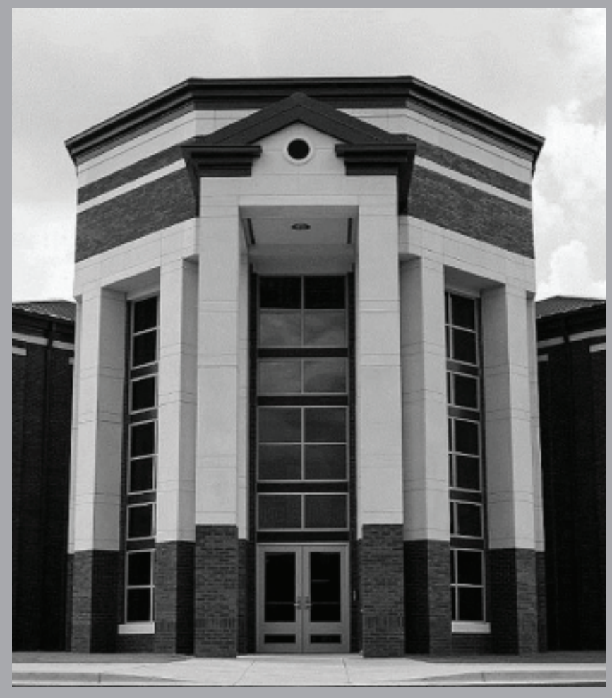
Student Dorms, Wadley Campus