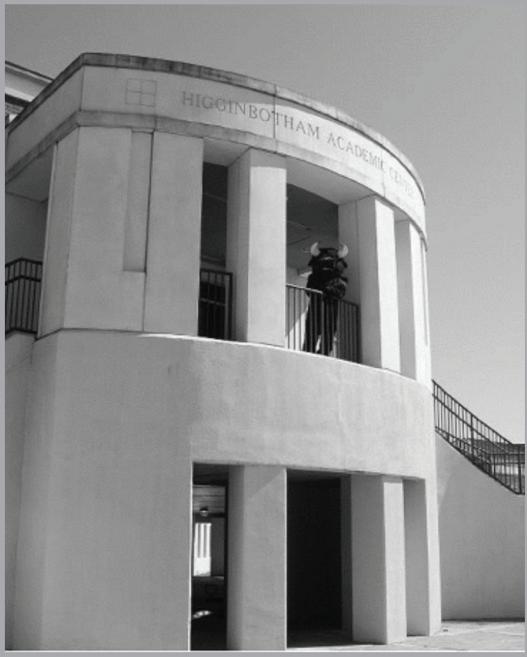
Higginbotham Academic Center, Opelika Campus