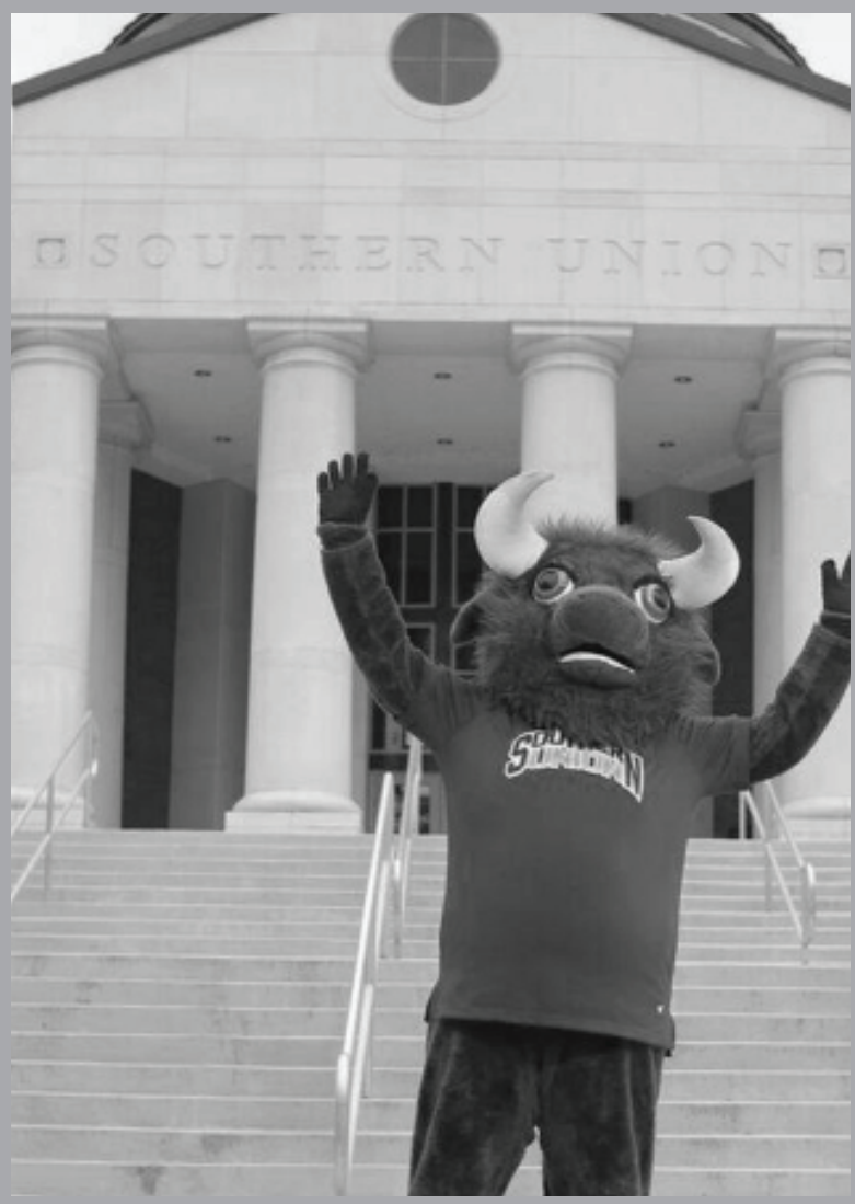
Southern Union Mascot, Battle the Bison