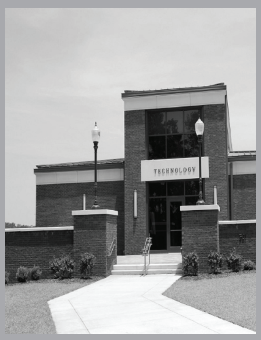
Technology Building, Valley Campus