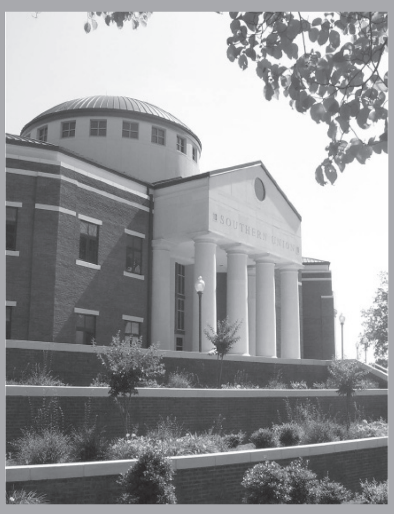
Administration Building, Wadley Campus