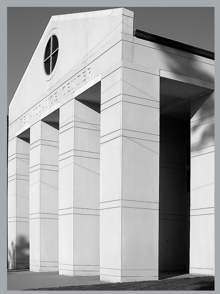
Renaissance Building, Wadley Campus