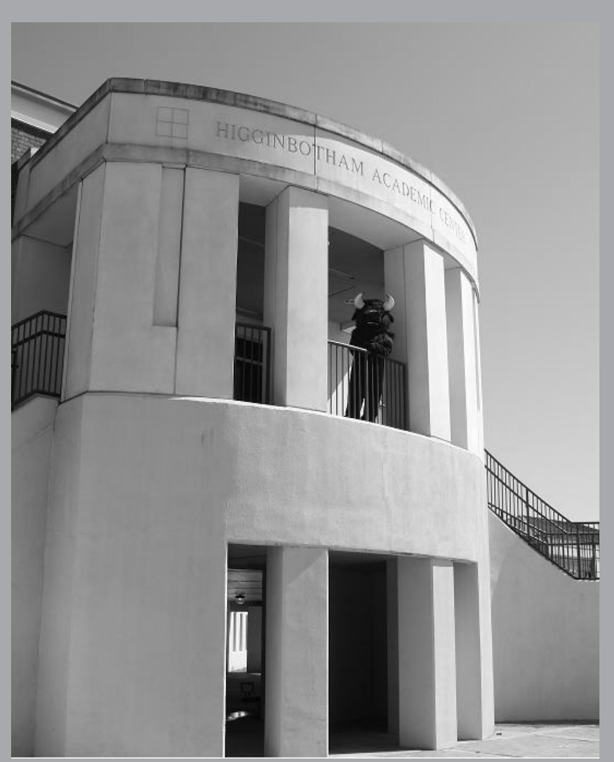
SU Mascot "Battle" at the Higginbothom Academic Center, Opelika Campus