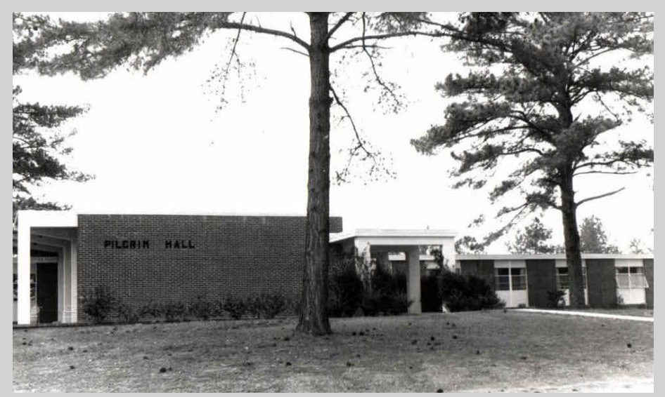
Old Pilgram Hall Building, Wadley Campus

Failure to examine the Student Handbook/ Code of Conduct does not excuse students from the policies and procedures described herein. Individual fators, illness, or conflicting advice from any source are not satisfactory grounds for seeking exemptions from these policies and procedures. All policies contained in the Student Handbook/ Coade of Conduct are subject to change without prior notice.