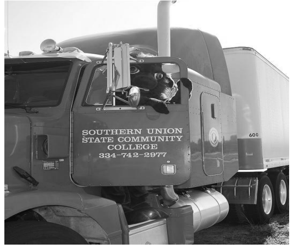
SU Mascot Battle in the SUSCC Tractor-Trailer