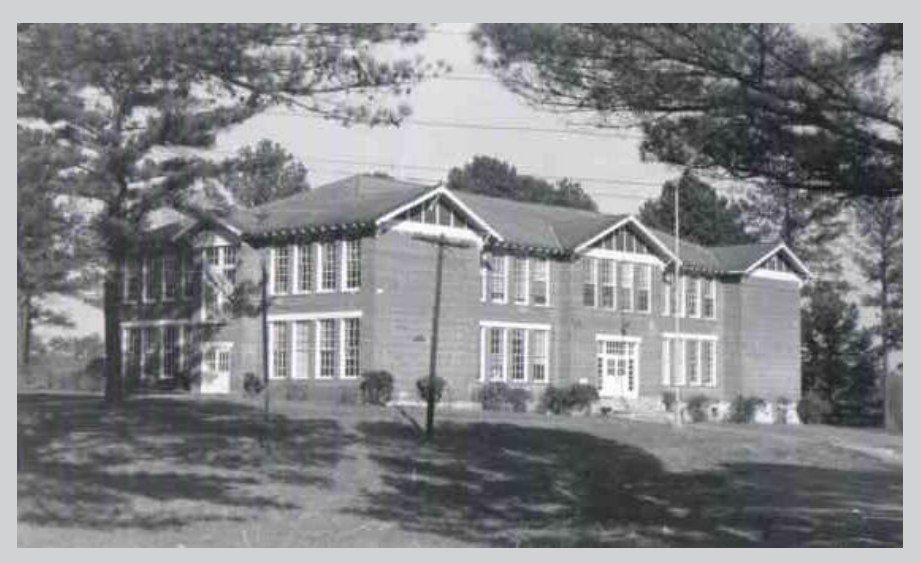
Old Elder Hall, Wadley Campus

NOTE: All regulations, policies, procedures, and prices relating to the college residence halls and cafeteria are subject to change without prior notice by the college administration, Judiciary or Student Services Committee, and/or Student Government Association.