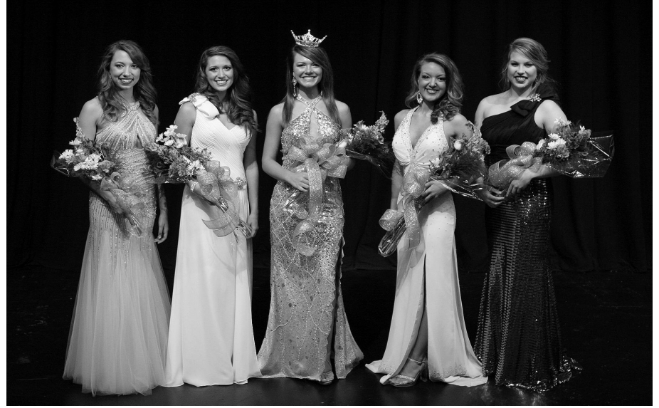
Miss Southern Union 2012 and Alternates

Any course for which a student has previously registered may be repeated. Each attempt that results in an official grade (A, B, C, D, F) will be recorded on the student's transcript, and each attempt resulting in an official grade will be used in computing the grade point average except in the case of implementation of the grade adjustment policy. No course in which the last grade received was an "F" may be counted toward graduation. Also, a course may be counted only once toward fulfillment of credit hours for graduation. The student should be aware that the last grade recorded may be regarded by a senior institution as the grade of record for transfer purposes. Institutional Scholarships will not pay for a repeat of successfully completed courses.