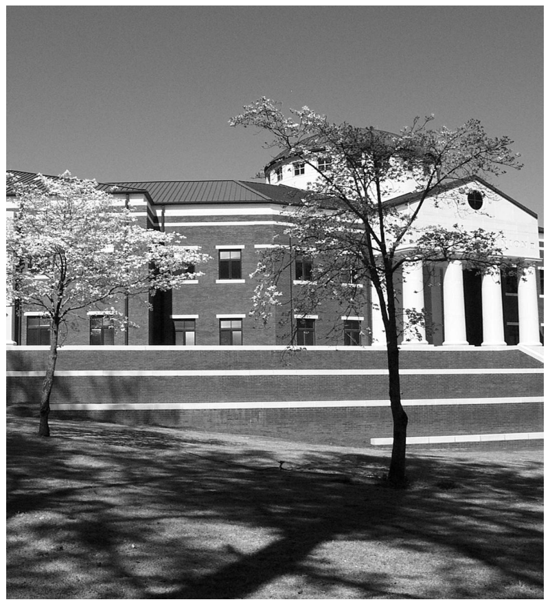
Administration Building, Wadley Campus

*Note OAD 101 and 103 may be challenged. OAD 125 Prerequisites: OAD 101 and OAD 103 (both may be challenged)