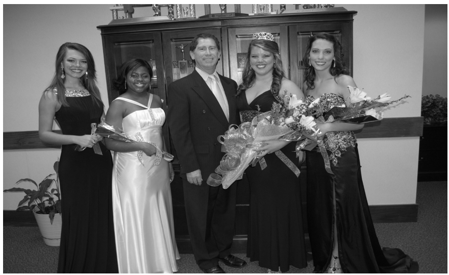
SU Homecoming Queen 2012 and Court

This course utilizes computer based instructional modules which are designed to access and develop skills necessary for workplace success. The instructional modules in the course include applied mathematics, applied technology, reading for information, and locating information. Use completion of this course, students will be assessed to determine if their knowledge of the subject areas has improved.